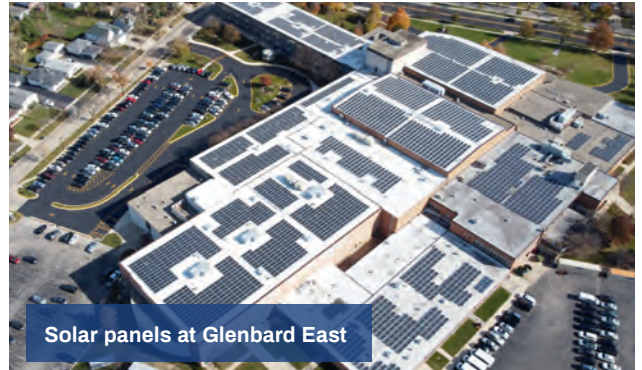
Solar panels at Glenbard East