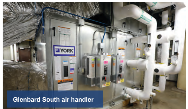
Glenbard South air handler