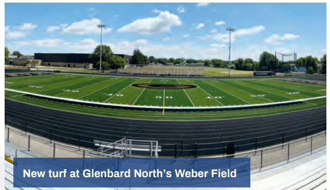
New turf at Glenbard North's Weber Field