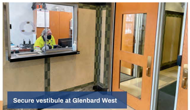
Secure vestibule at Glenbard West