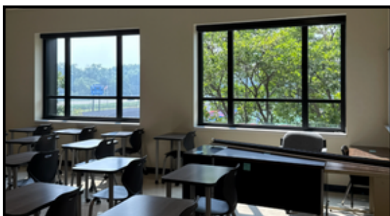
New windows installed in the west wing, bringing in natural light.