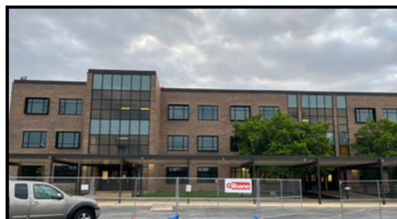
The west wing shines brighter with new window installations.