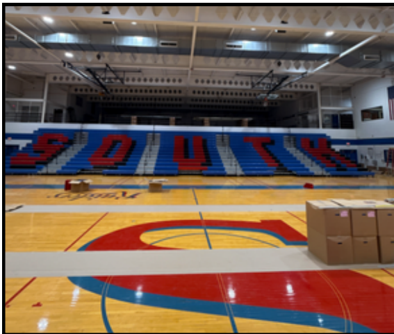
Newly installed bleachers give the gym a refreshed look.

Looking ahead: We are finalizing the interior design plans for the 100 level of the classroom tower, which will feature updated classroom finishes, culinary lab renovations, science lab renovations, and new windows to be included on the north and south side of the classroom tower. This work is scheduled for summer 2026. At the same time, design will begin for an enhanced secure entrance, and renovations to the commons, continuing our investment in safe, modern, and welcoming spaces for students.