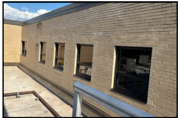
New windows installed to bring in more natural light.