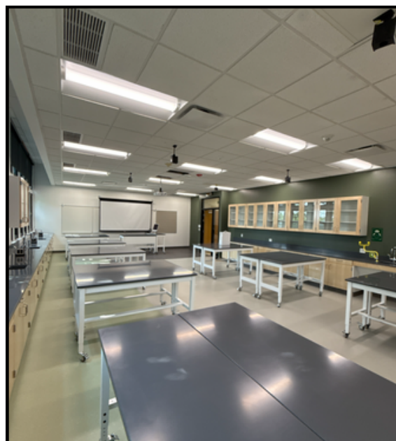
Upgraded science classrooms with modern finishes.