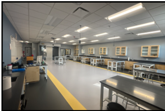
Upgraded science lab designed to support hands-on learning and collaboration.

Looking ahead: We're finalizing the design of the performing arts addition and further science lab upgrades, with construction scheduled to begin in late spring or early summer 2026. At the same time, design work will kick off of the new main entrance, learning commons, and updated art and guidance area – all aimed at creating even better learning space for students to learn and grow.