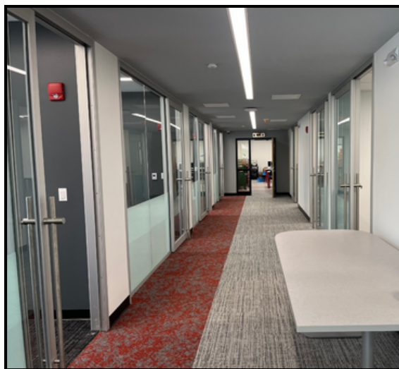
The LRC and breakout rooms now feature updated lighting, flooring, paint, ceiling tiles, and brand-new furniture.