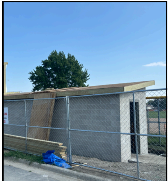
Softball dugout construction in progress.