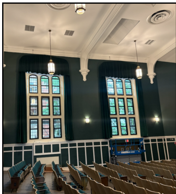
Fresh window installations brighten the East and West sides of the auditorium.