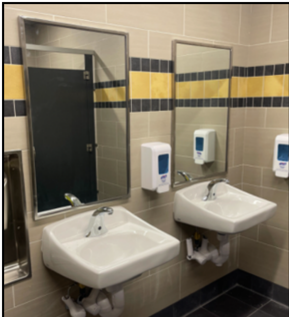
Newly renovated restrooms enhance comfort and accessibility.