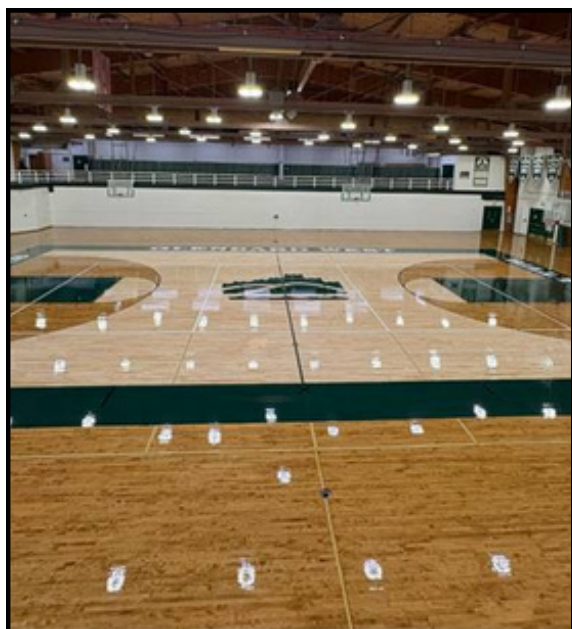
Refinished floor complete in Biester Gym.

The Board of Education will review and vote on bids in late January, with groundbreaking scheduled for early spring.