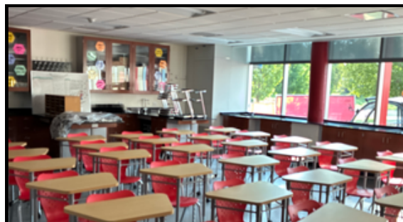
Classrooms updated with fresh finishes and new furniture.