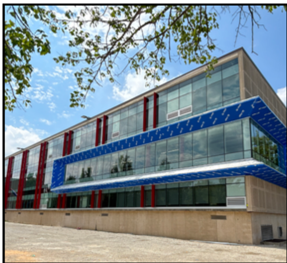
First phase of new glass exterior wall completed on the Main Street side.

Looking ahead: Work on the curtain wall will continue on the west side of the building next summer. We are excited to share that construction on the new visitors entry, main office, and cafeteria expansion is expected to begin as soon as October 2025. Starting in summer 2026, families and students can look forward to a new learning commons, updated exterior glass all on the west and north faces of the classroom wings, and interior upgrades including a new guidance suite and classroom finish.