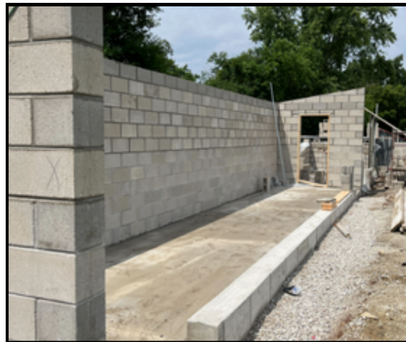
New dugouts for baseball and softball will be ready just in time for spring season.