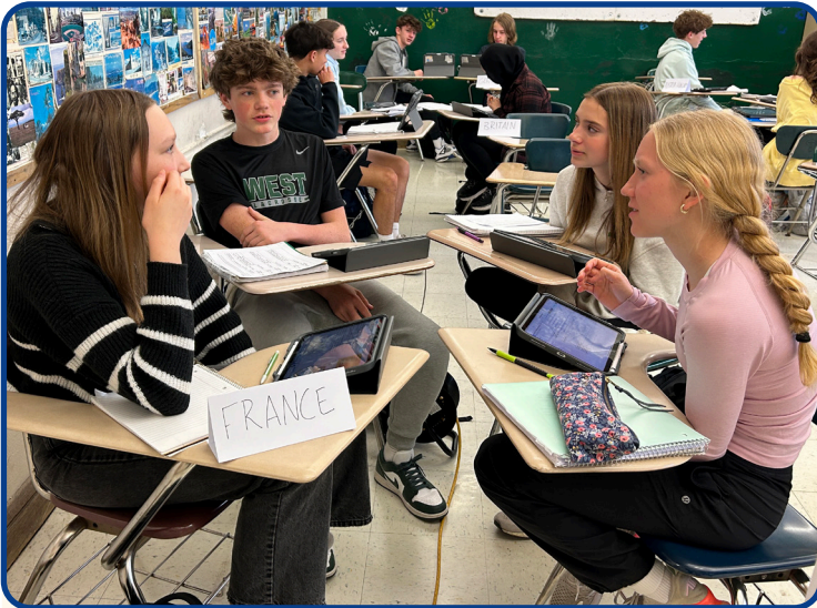
Class experiences that mirror college and work scenarios are among deeper learning experiences available in the new schedule.

Throughout the 2023-24 school year, our talented educators participated in the district’s numerous professional development offerings . These sessions prepared them to effectively plan and teach for deep learning in a block period. They learned about topics such as: student-led discussion and activities; student supports within the class; student choice; and teaching about our Profile of a Graduate. This focused professional development will continue in the 2024-25 school year.