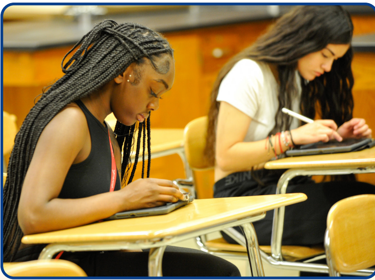
The hybrid block schedule will provide our students with more opportunities for deep learning experiences.